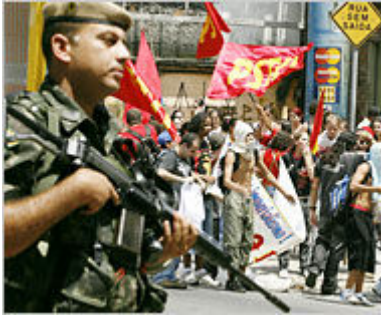
Brazilian police kept watch over the protest that passed the Hilton Hotel in Sao Paulo.