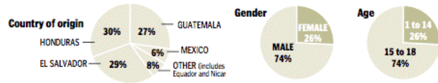
Demographics of children in shelters, fiscal 2006*

*Percentages do not include shelter placement in last two months of fiscal year.